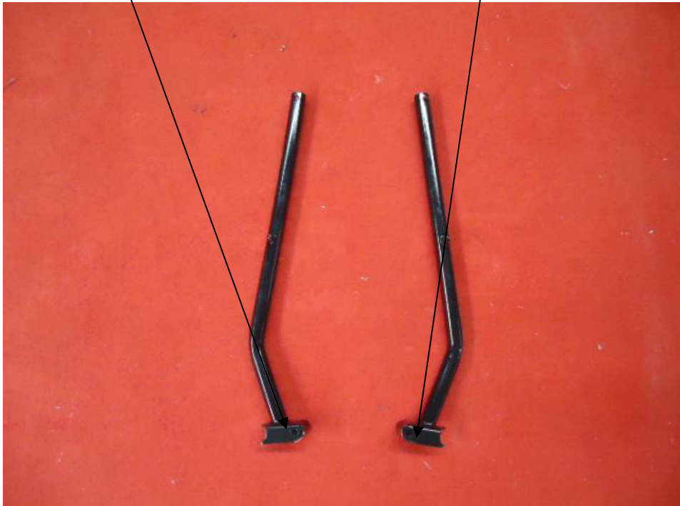
Rain cover fixing dot